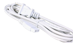
Hardwire Connector Hardwire Connector for TBD.UCS Series White 72": TBD.HWC-72-WH Black 72": TBD.HWC-72-BK