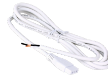
Power Feed Cable AC direct plug-in applications White 72": TBD.PCA-72-WH Black 72": TBD.PCA-72-BK