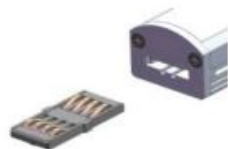
TBD.CL-SMC Mini Coupling (Included)