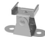
TBD.E20-ADJ Adjustable Bracket (Sold Separately)