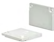
TBD.E20-EC End Caps (2 Included)