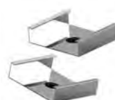
TBD.E20-MC Mounting Clips (Sold Separately)